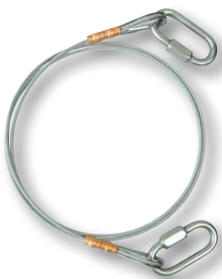
Arrangement shown with 2 Quick Links

All Standard Flag Arrangements can be mixed to achieve the higher quantity pricing.