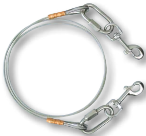
Arrangement for flag size 6' x 10' or smaller