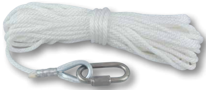
Poly Rope Assembly # 360096 shown